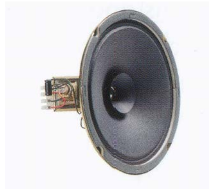
Figure 1. EA0001 Loudspeaker