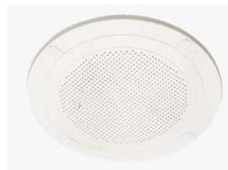
Figure 2. EA0102 Grille